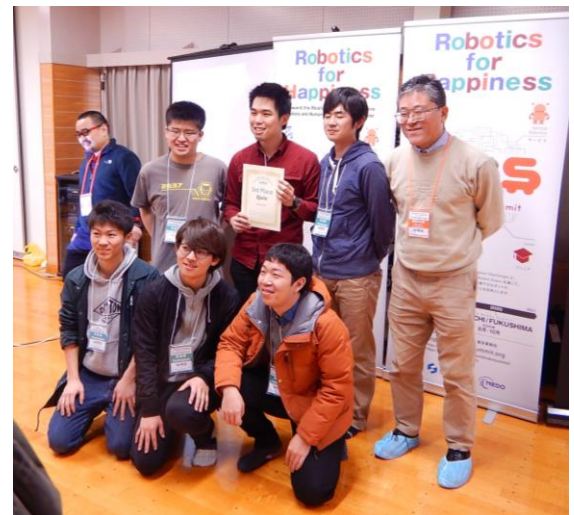
Quix (Tohoku University)